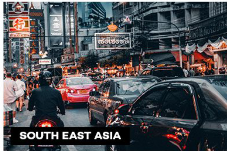
SOUTH EAST ASIA