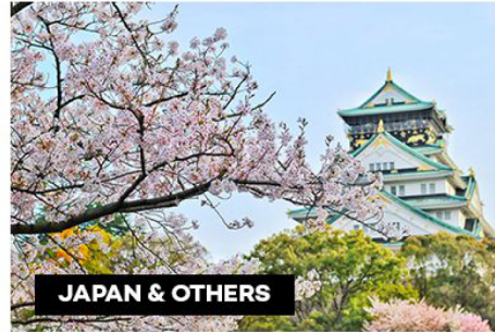
JAPAN & OTHERS

IBC JAPAN LTD 64 MIYANOMAE-CHO, NAKAJIMA, FUSHIMI-KU, KYOTO JAPAN